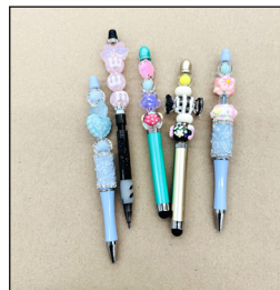
Samples of pens, stylus and mechanical pencils