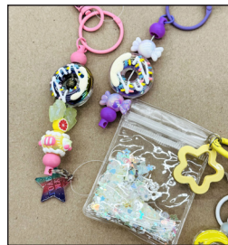
Samples of Keychains