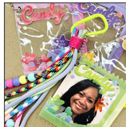
Samples of Keychains and Photo Pouches