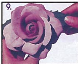
9. Attach leaves to the the rose.

No portion of design or written instructions may be reproduced in any form. The information on this instruction sheet has been tested and is presented in good faith, but no warranty is given, nor are results guaranteed. Claycompany.com disclaims all liability from any injury or unsatisfactory results. Warning: Due to the components used in this craft, children under 5 years of age should not have access to materials or supplies.