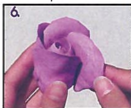
6. Place the rest of the rose petals and form a rosebud.