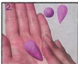
2. To make petals; roll clay into teardrop shape and place clay in your palm.