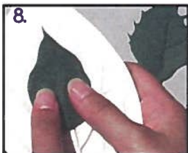
8. To make leaves; roll clay into teardrop shape, slightly flatten. Place clay on the leaf mold and flatten.