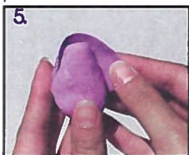
5. Place the second petal slightly higher than the first petal.