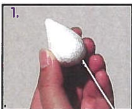
1. Mix clay to desired color. Insert floral wire into the foam shape.