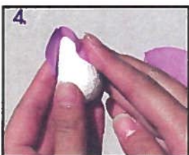
4. Place the first petal on the foam 1/8" above the tip of the foam, making sure the thin edge is facing up.