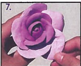
7. Continue to make more petals and add it to the rose.